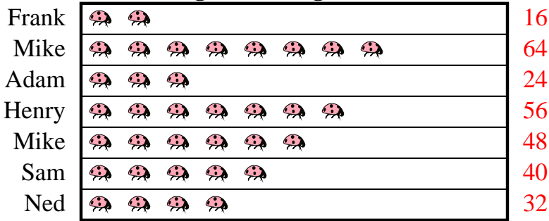
Bug Catching Contest

Tom and his friends were trying to see who could catch the most bugs in a day. They recorded their information in the pictograph below.