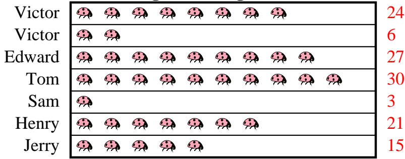
Bug Catching Contest

Mike and his friends were trying to see who could catch the most bugs in a day. They recorded their information in the pictograph below.